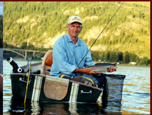
Lower Arrow Lake

The Kootenay River runs between Nelson and Castlegar with 40 km of both slow and fast water. Large Rainbow, Bull trout, Kokanee, and Whitefish are available. The Slocan Pool, where the Slocan River joins the Kootenay River, is renowned for its fly-fishing for Rainbow to 2 kg. Walleye and Rainbow trout to 2.5 kg are abundant within 2 km of the confluence with the Columbia River.